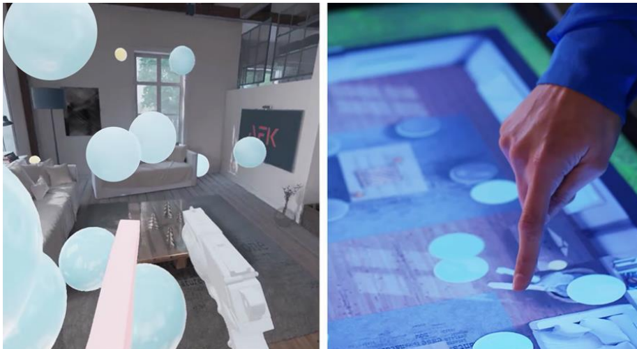
6. Images from CeBIT 2017 ( download )